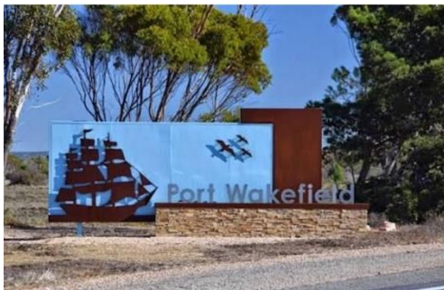
Port Wakefield Entry statement

As suggested above, CCC recommends that the area be promoted as the Shorebird/Samphire Coast* . To support this brand entry signage to each community would take standard format. This has been very successful in Wakefield Regional Council, and the standard signage should be compatible across the entire Adelaide Plains Council area including such communities as Two Wells, Mallala, Redbanks, Long Plains, Lower Light and Wild Horse Plains. In the coastal areas the signage would emphasise the Shorebird/Samphire Coast*