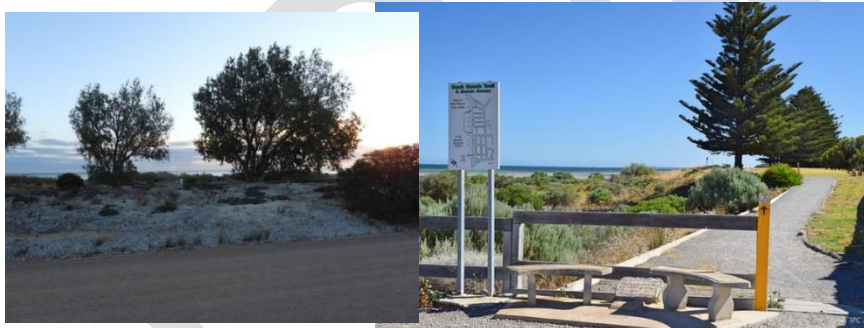
< This could become like this >